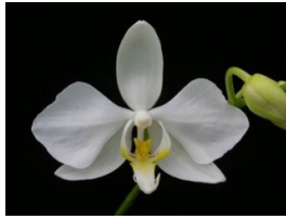
Phalaenopsis amabilis var. rosenstromii