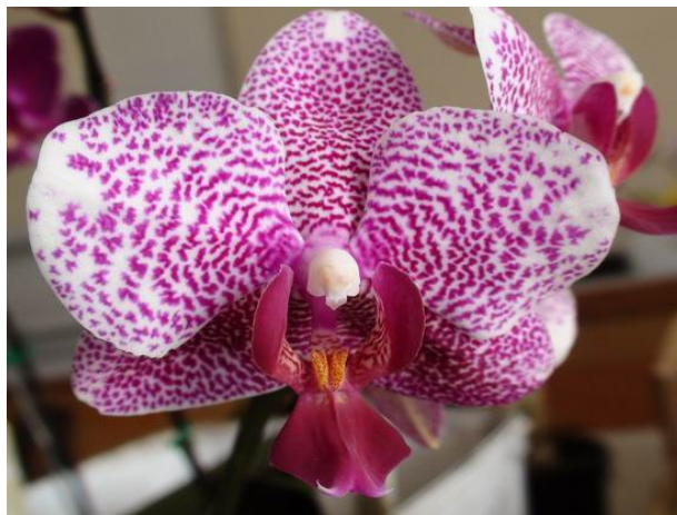
Mystery plant 1694 is Phal. Ho's Fantastic Yew